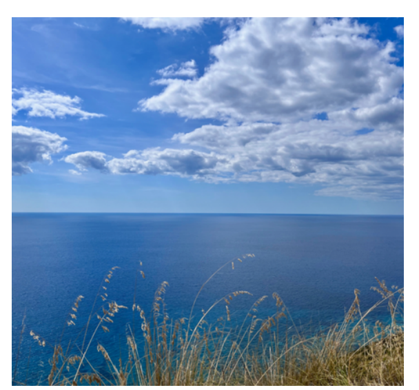
The other Pontine Islands

Today Santo Stefano, together with Ventotene, constitutes the heart of the marine protected area which determines its accessibility based on the provisions foreseen.